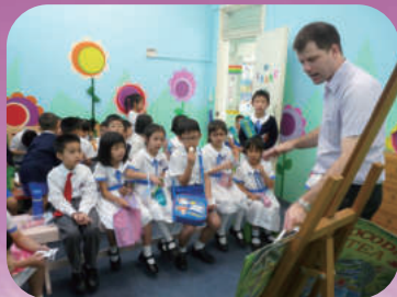
"Once upon a time, ..."