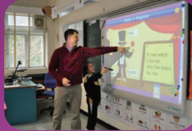
"I love using the e-whiteboard!"

Students regularly have a chance to speak and read individually. Reading is usually regarded as one of the most effective ways of second language learning, so this is the focus of PLPRW.