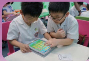
"These iPad games are so much fun!"

The NET teacher has also organised English games for Mid Autumn Festival and Chinese New Year.