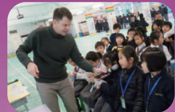
"I'm ready to get my prize!"