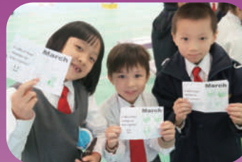
"We've got a lot of stamps!"

There is a playground English activity, on most Tuesdays. Students bring their English Passport to get a stamp/chop. We have had storytelling, quizzes and there are lots of fun prizes.