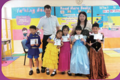
"Look at us on the stage!"